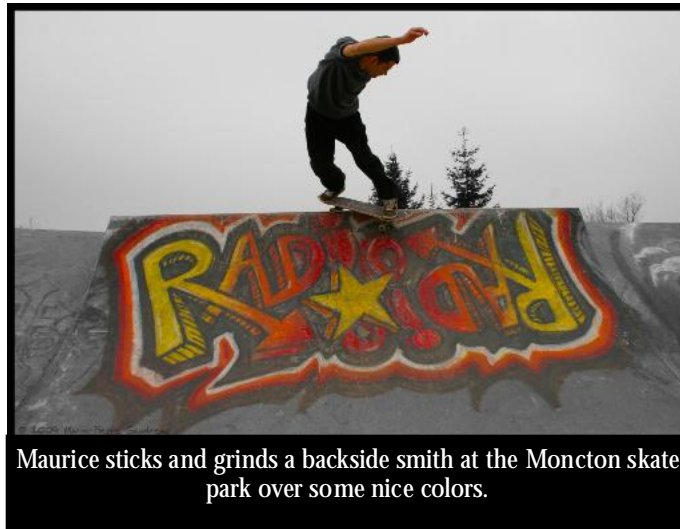
Maurice sticks and grinds a backside smith at the Moncton skate park over some nice colors.

Keep positive with things and always keep sk8ting and things are never really as bad as sometimes they appear to be.